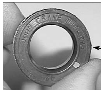
This side mates against the impeller.