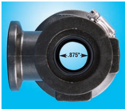
Standard Gasket (more restrictive)