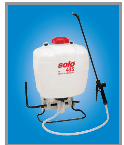
Solo 435 Part no.: 1820435