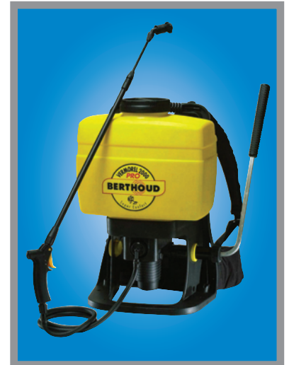
Comfort Pro 2000 Part no.: 18102022